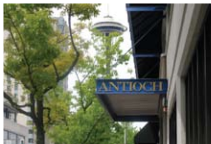
Antioch University Seattle

Antioch University New England is home to one of the nation's only Waldorf teacher preparation programs and a Green MBA program ranked in the top 5 nationally. Located in Keene, New Hampshire, AUNE is steeped in New England's traditions of self-reliance, local initiative, and private action for the public good, with students hailing from over 40 states and 19 foreign countries.