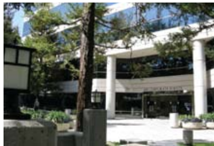
Antioch University Los Angeles

Antioch University Midwest has developed a cutting-edge program in conflict analysis and engagement. Located in the independently minded and progressive town of Yellow Springs, Ohio, AUM's coursework is collaborative and experiential, designed to meet adult learners where they are and help them achieve their educational goals and effect social change.