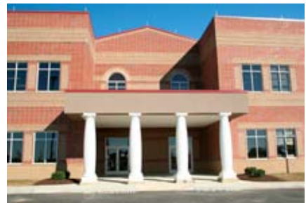
Antioch University Midwest