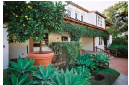
Antioch University Santa Barbara