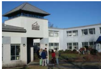
Antioch University New England