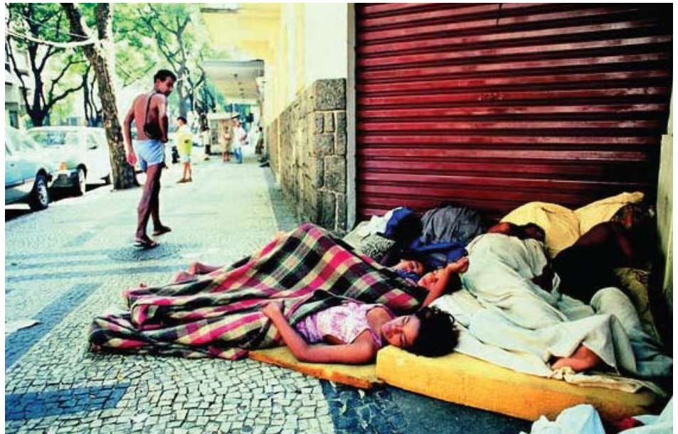
Homeless Brazilian street children face dangerous conditions daily in Rio de Janeiro.