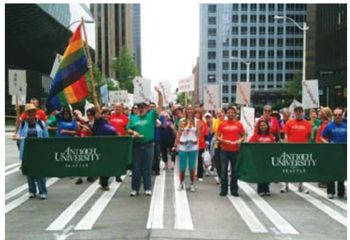
Over 60 AUS students, faculty, staff and friends participated in PrideFest 2010, joined by a few faculty from AUSB and AULA who were here for the all faculty conference. Everyone received colorful tee-shirts, representing the rainbow colors of the pride flag.